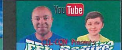
CIL-CON Presents FEL DESIRE FAST, ELECTRONIC AND LOUD