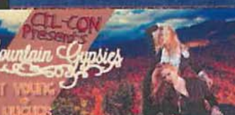
CIL-CON Presents Mountain Gypsies OUT YOUR TESS HUGLES